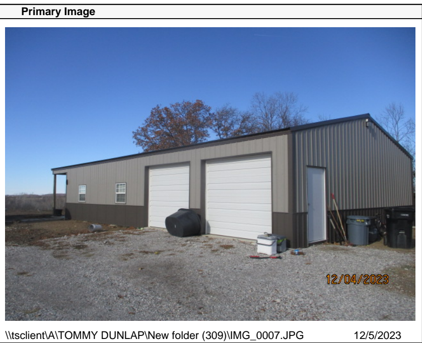
\\tsclient\A\TOMMY DUNLAP\New folder (309)\IMG_0007.JPG 12/5/2023