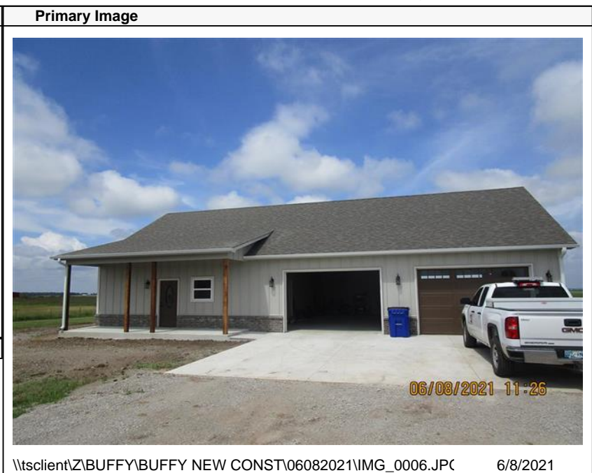
\\tsclient\Z\BUFFY\BUFFY NEW CONST\06082021\IMG_0006.JPG 6/8/2021