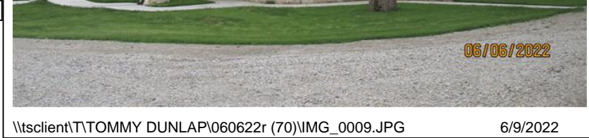
\\tsclient\T\TOMMY DUNLAP\060622r (70)\IMG_0009.JPG 6/9/2022