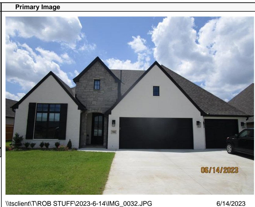
\\tsclient\T\ROB STUFF\2023-6-14\IMG_0032.JPG 6/14/2023