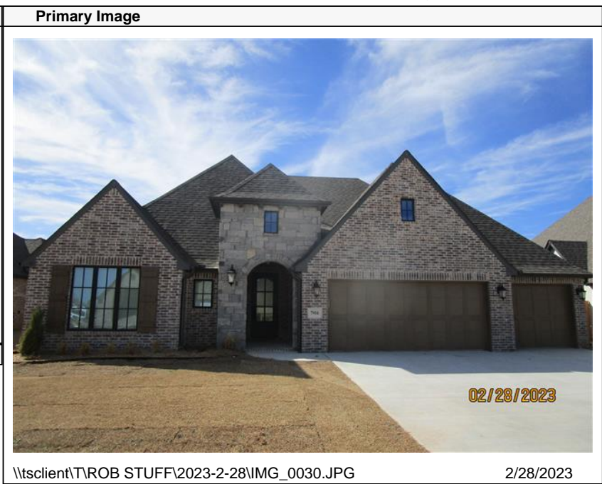
\\tsclient\T\ROB STUFF\2023-2-28\IMG_0030.JPG 2/28/2023