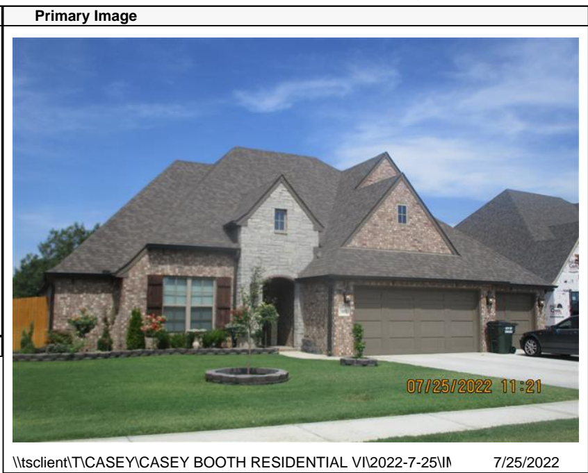
\\tsclient\TCASEY\CASEY BOOTH RESIDENTIAL VI\2022-7-25\ 7/25/2022