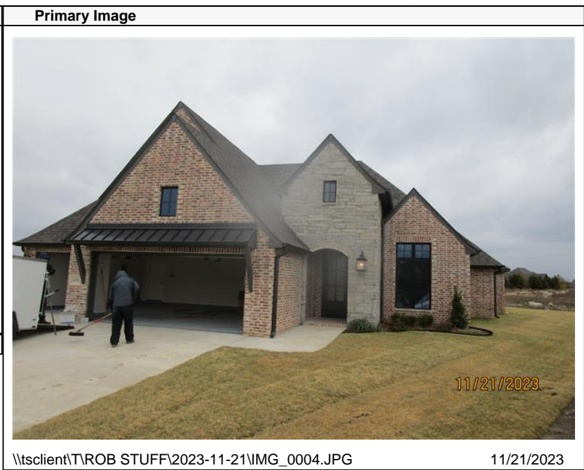
\\tsclient\T\ROB STUFF\2023-11-21\IMG_0004.JPG 11/21/2023