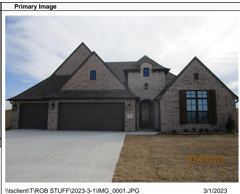
\\tsclient\T\ROB STUFF\2023-3-1\IMG_0001.JPG 3/1/2023