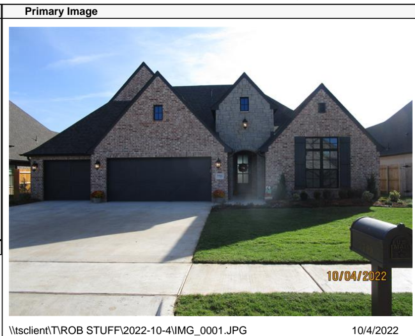
\\tsclient\T\ROB STUFF\2022-10-4\IMG_0001.JPG 10/4/2022