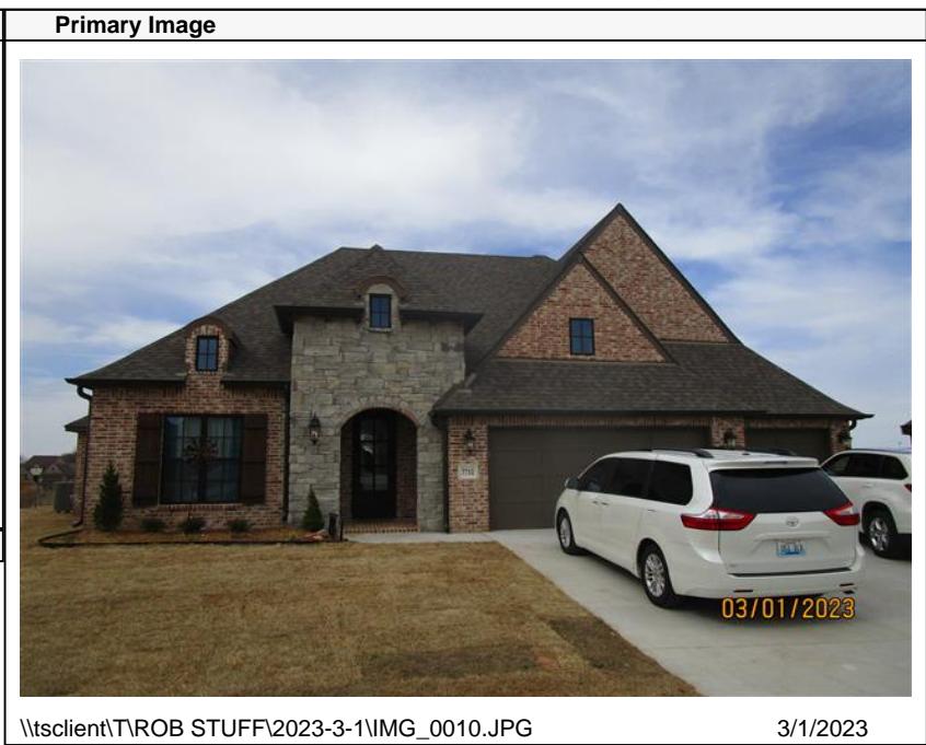
\\tsclient\T\ROB STUFF\2023-3-1\IMG_0010.JPG 3/1/2023