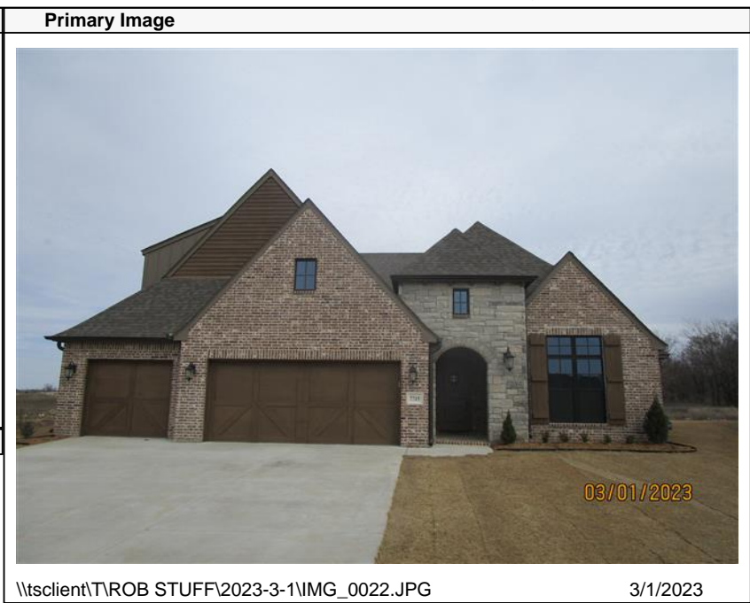
\\tsclient\T\ROB STUFF\2023-3-1\IMG_0022.JPG 3/1/2023