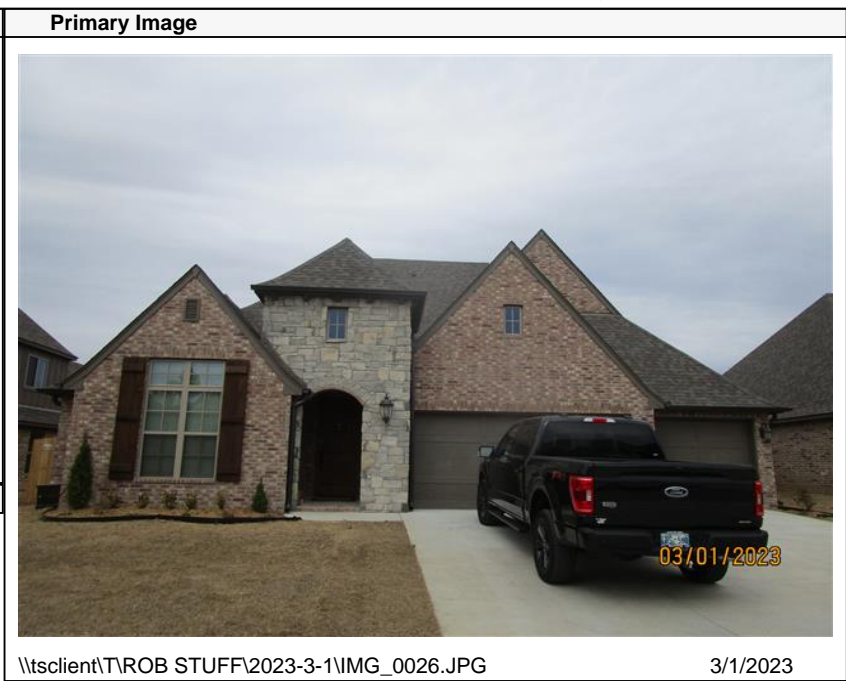
\\tsclient\T\ROB STUFF\2023-3-1\IMG_0026.JPG 3/1/2023