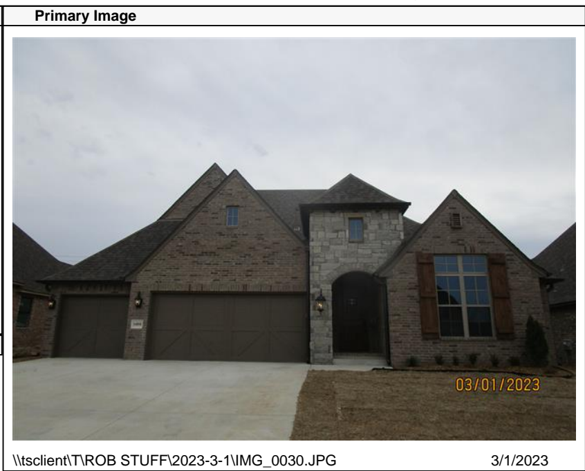
\\tsclient\T\ROB STUFF\2023-3-1\IMG_0030.JPG 3/1/2023