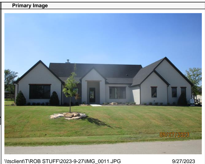
\\tsclient\T\ROB STUFF\2023-9-27\IMG_0011.JPG 9/27/2023