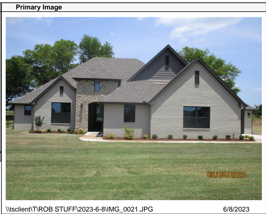
\\tsclient\T\ROB STUFF\2023-6-8\IMG_0021.JPG 6/8/2023