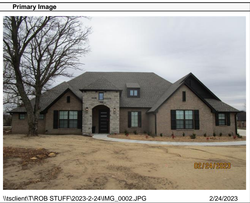
\\tsclient\T\ROB STUFF\2023-2-24\IMG_0002.JPG 2/24/2023