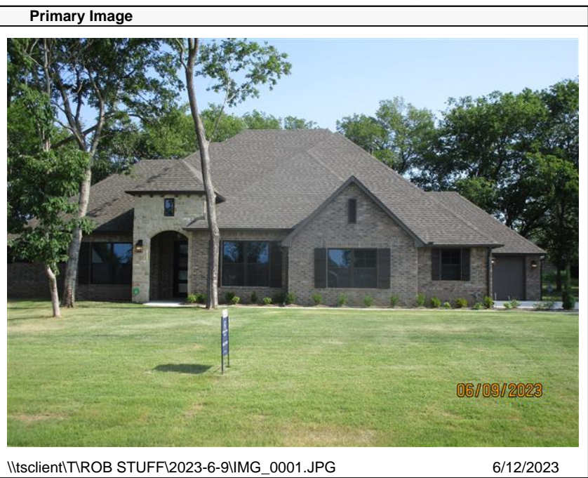
\\tsclient\T\ROB STUFF\2023-6-9\IMG_0001.JPG 6/12/2023