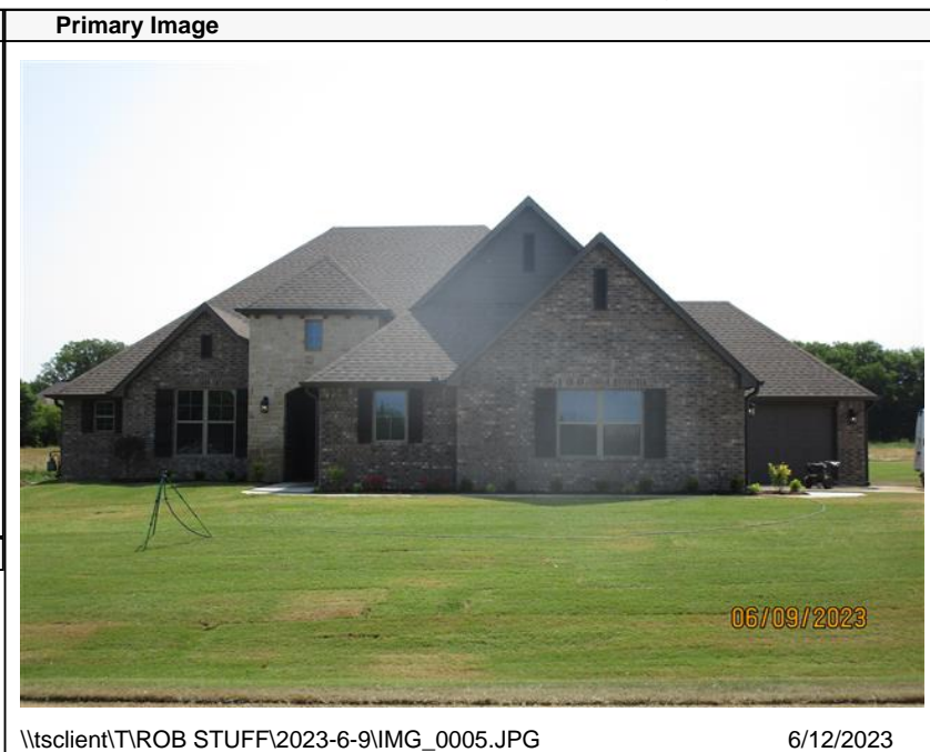
\\tsclient\T\ROB STUFF\2023-6-9\IMG_0005.JPG 6/12/2023