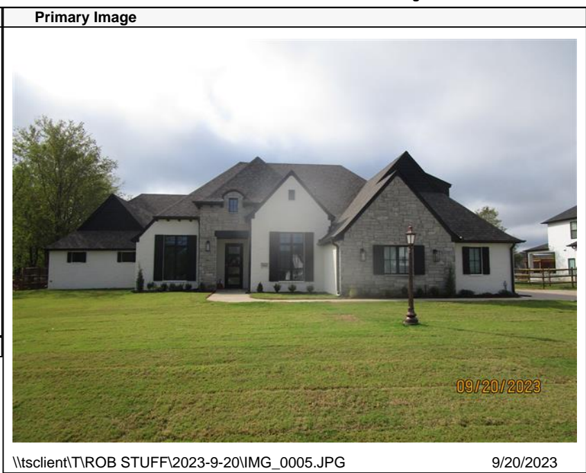
\\tsclient\T\ROB STUFF\2023-9-20\IMG_0005.JPG 9/20/2023