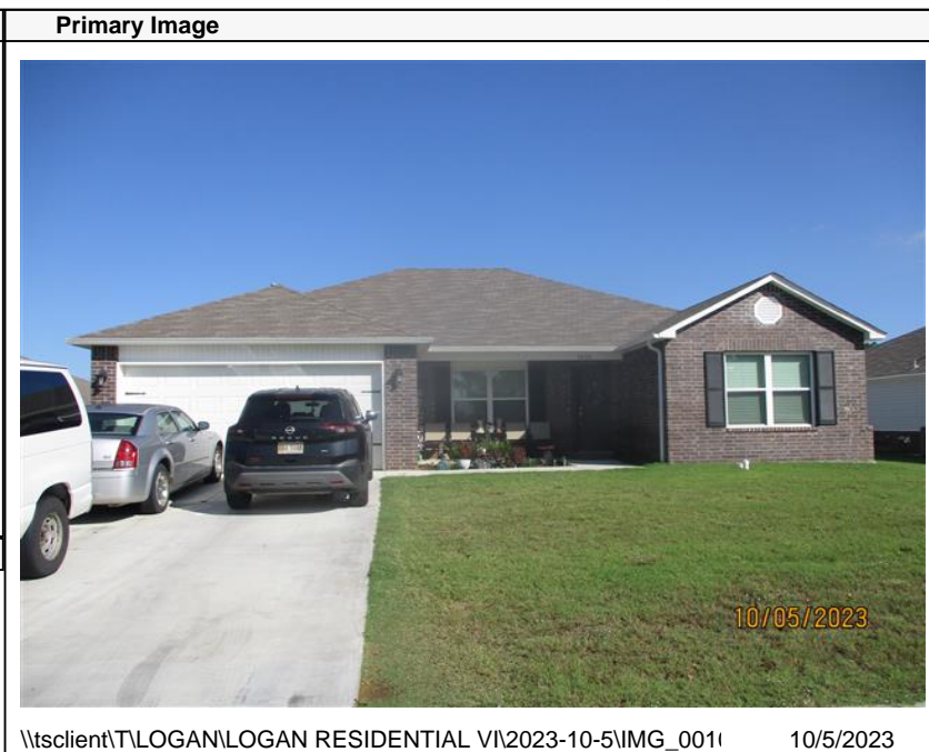
\\tsclient\T\LOGAN\LOGAN RESIDENTIAL VI\2023-10-5\IMG_001 10/5/2023