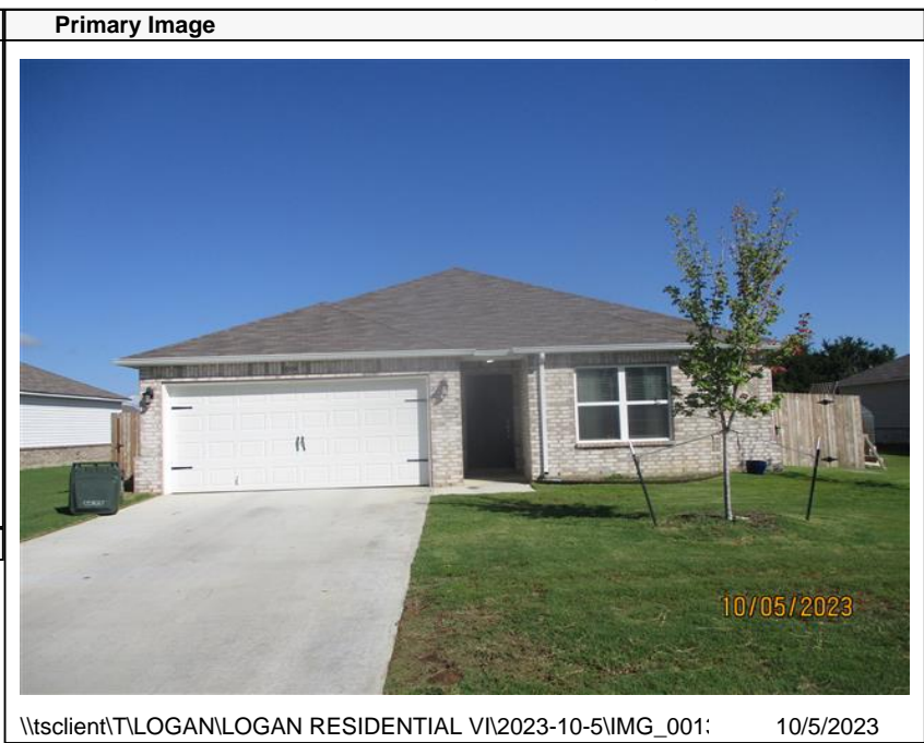
\\tsclient\T\LOGAN\LOGAN RESIDENTIAL VI\2023-10-5\IMG_001: 10/5/2023