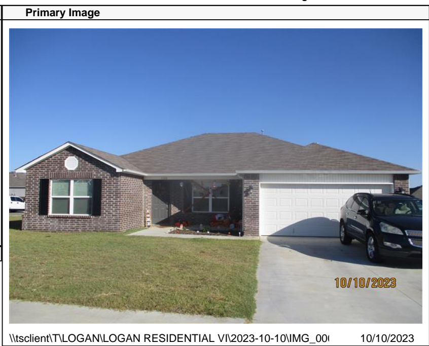
\\tsclient\T\LOGAN\LOGAN RESIDENTIAL VI\2023-10-10\IMG_001 10/10/2023