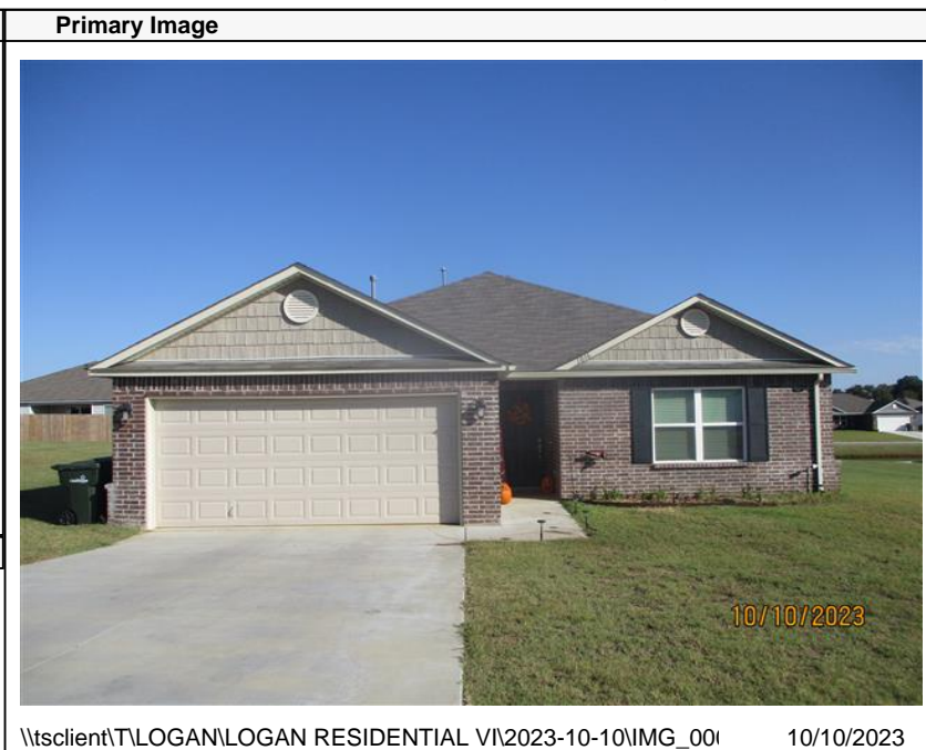
\\tsclient\T\LOGAN\LOGAN RESIDENTIAL VI\2023-10-10\IMG_001 10/10/2023