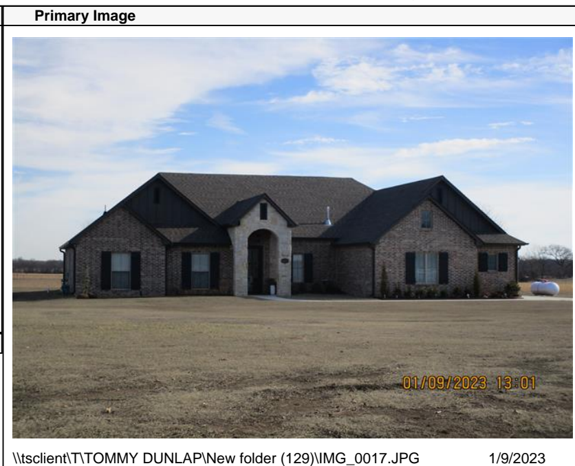
\\tsclient\T\TOMMY DUNLAP\New folder (129)\IMG_0017.JPG 1/9/2023