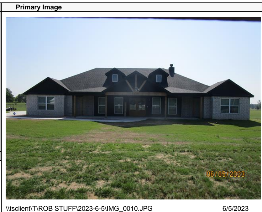
\\tsclient\T\ROB STUFF\2023-6-5\IMG_0010.JPG 6/5/2023