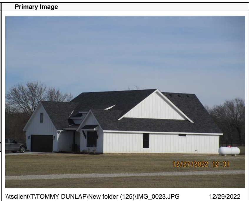
\\tsclient\T\TOMMY DUNLAP\New folder (125)\IMG_0023.JPG 12/29/2022