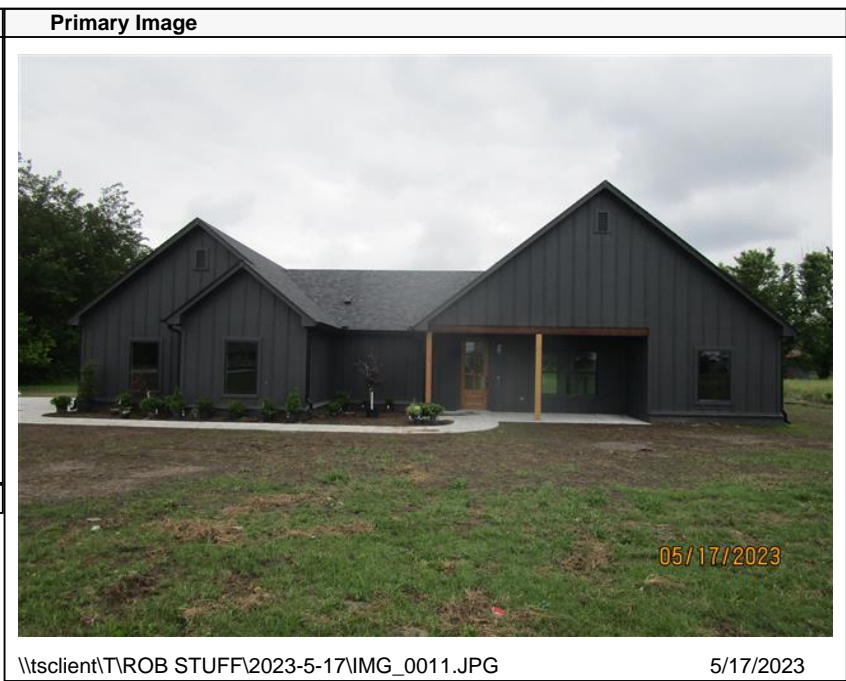
\\tsclient\T\ROB STUFF\2023-5-17\IMG_0011.JPG 5/17/2023