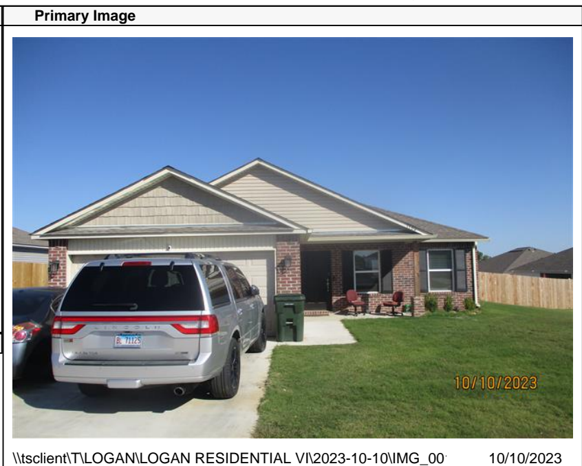
\\tsclient\T\LOGAN\LOGAN RESIDENTIAL VI\2023-10-10\IMG_00 10/10/2023