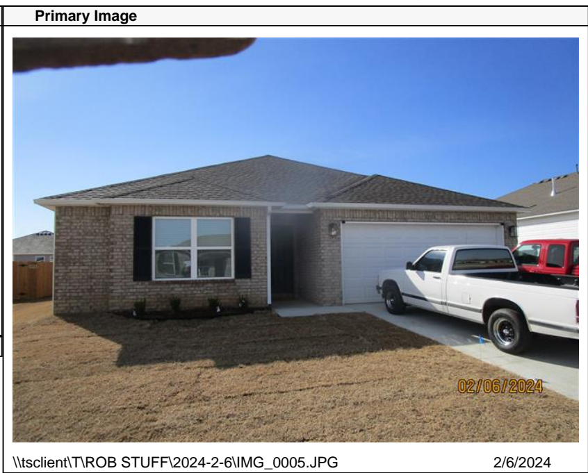
\\tsclient\T\ROB STUFF\2024-2-6\IMG_0005.JPG 2/6/2024