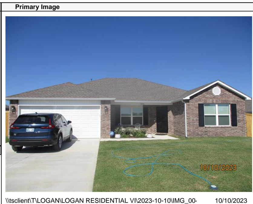
\\tsclient\T\LOGAN\LOGAN RESIDENTIAL VI\2023-10-10\IMG_00 10/10/2023