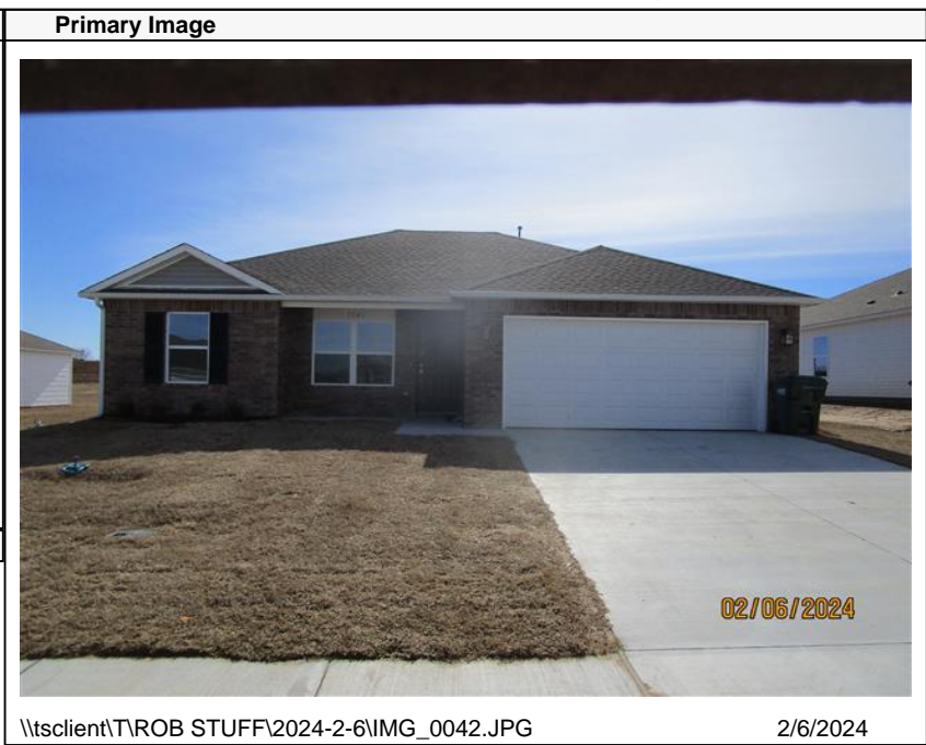
\\tsclient\T\ROB STUFF\2024-2-6\IMG_0042.JPG 2/6/2024