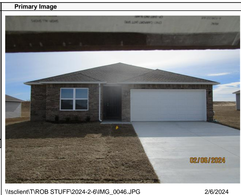
\\tsclient\T\ROB STUFF\2024-2-6\IMG_0046.JPG 2/6/2024