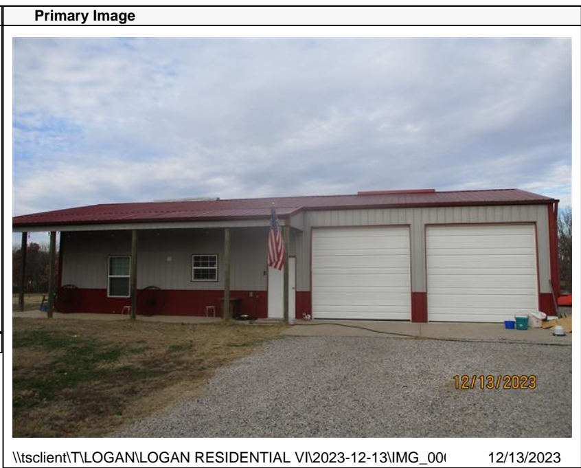
\\tsclient\T\LOGAN\LOGAN RESIDENTIAL VI\2023-12-13\IMG_001 12/13/2023