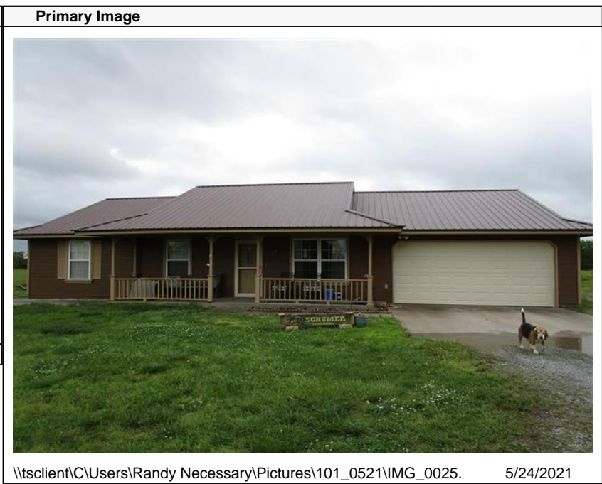
\\tsclient\C\Users\Randy Necessary\Pictures\101_0521\IMG_0025. 5/24/2021