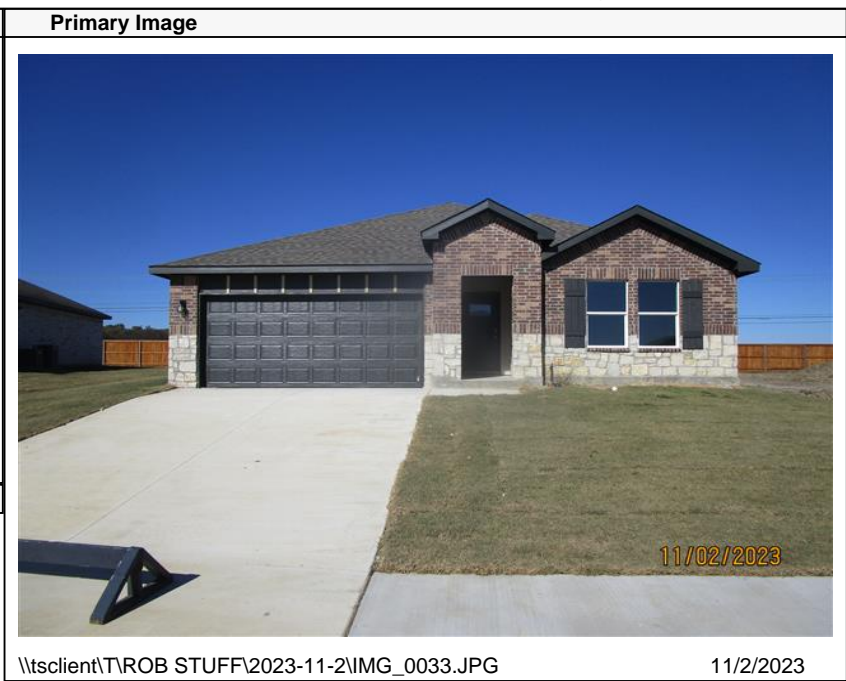
\\tsclient\T\ROB STUFF\2023-11-2\IMG_0033.JPG 11/2/2023