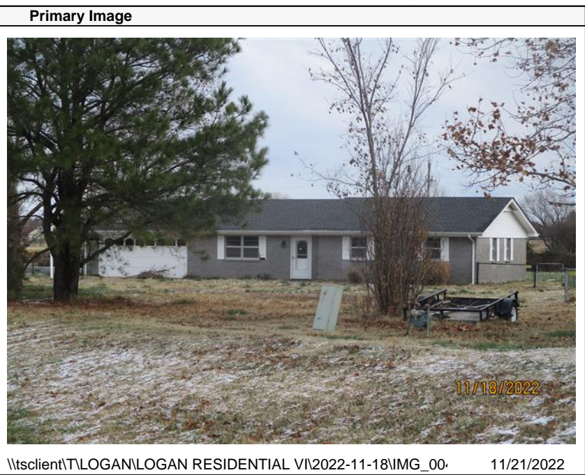
\\tsclient\T\LOGAN\LOGAN RESIDENTIAL VI\2022-11-18\IMG_00 11/21/2022