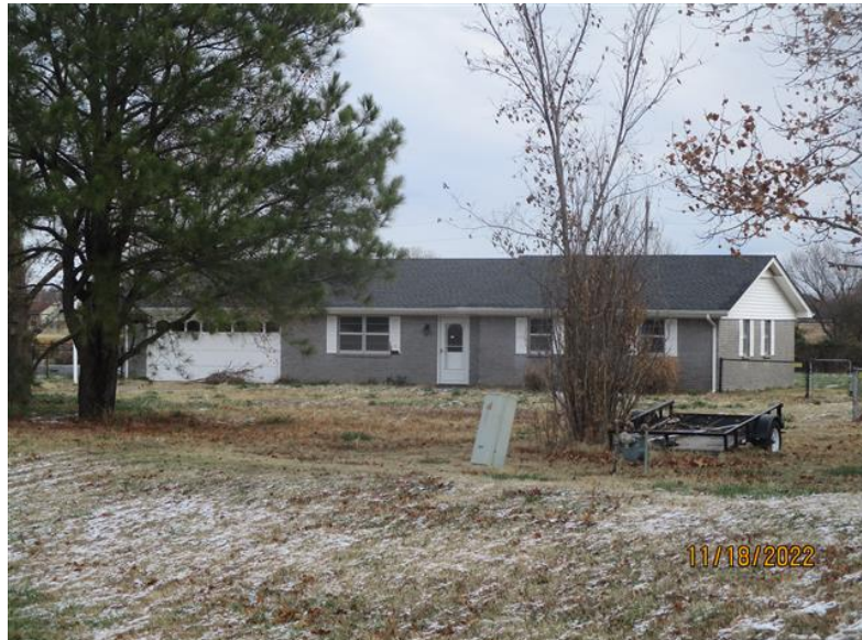
\\tsclient\T\LOGAN\LOGAN RESIDENTIAL VI\2022-11-18\IMG_00 11/21/2022

Situs 15491 S HWY 66 Subdivision Lot/Block / Parcel Size 1 - Acres Sec/Twn/Rng 13 / 22 / 16 / 2 Neighborhood 6050 - UNPLATTED School District S006 - SEQUOYAH SCHOOLS