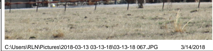
C:\Users\RLN\Pictures\2018-03-13 03-13-18\03-13-18 067.JPG 3/14/2018